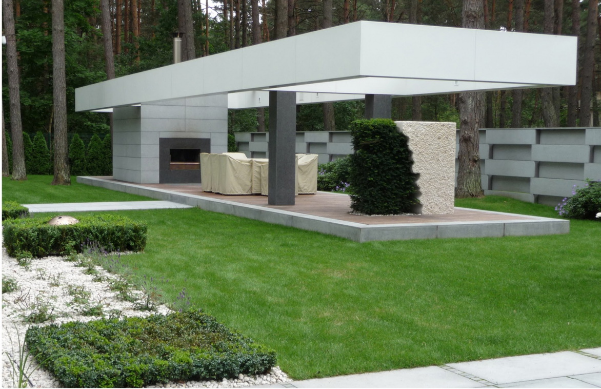
Waterfall supplying the basin. Perennial planting alongside the water basin. Taxus cuspidata Bonsai. Pavilion with wooden terrace and ash-lar-formed sculpture. Site plan. Japanese kare-san-sui 'dry garden'. Bronze lamp cap. Discus sculpture.